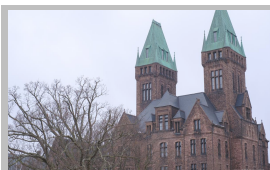
Hotel Henry to close Feb. 27